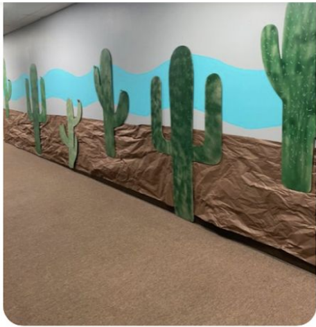
Children's Hallway decor for...