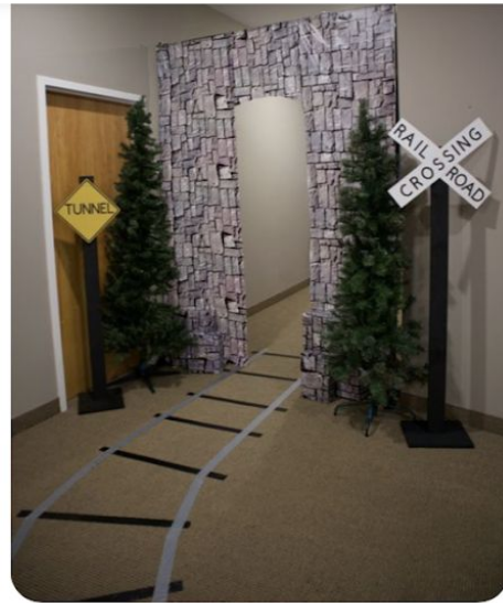
ALC VBS 2021