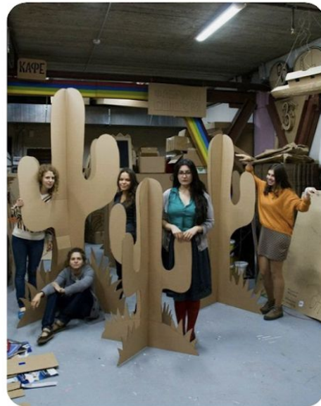
Workshop "Made in Cardboardia". September -...