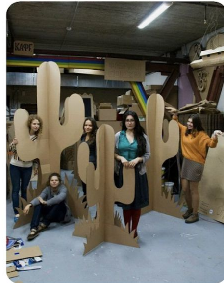
Workshop "Made in Cardboardia". September -...